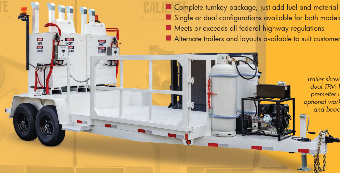
Trailer shown with dual TPM-1500 premelter units, optional work lights, and beacons