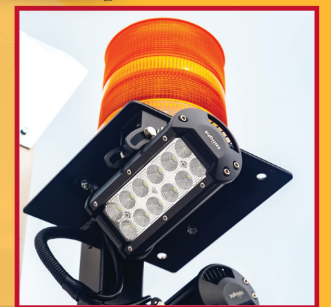
Optional worklights and title 13 strobes