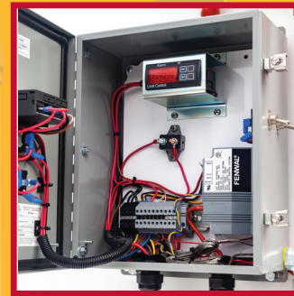
Over temperature safety controller