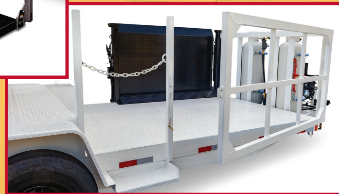
Deck loading rail swings open 180 degrees for ease of loading equipment and supplies