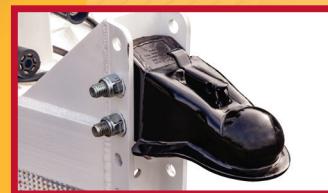
Choose from a pintle or ball hitch