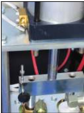
Shot size can be easily adjusted by moving trip lever in relation to limit switch