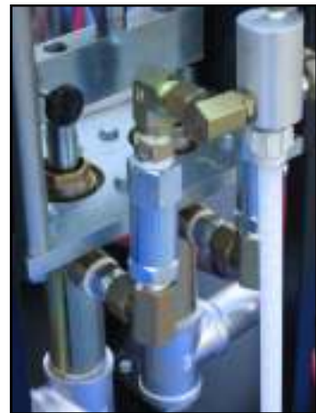
Output check valves are located for ease of service at inlet to injector block