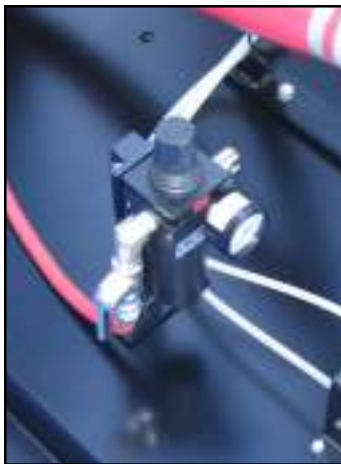
A combo filter/regulator allows easy pressure adjustments to the drive cylinder