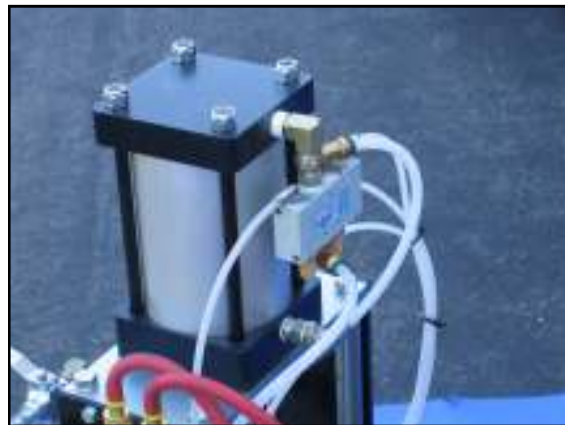
A pneumatically operated drive cylinder is controlled by a 4 way valve. A touch of the palm switch gives a measured shot of material