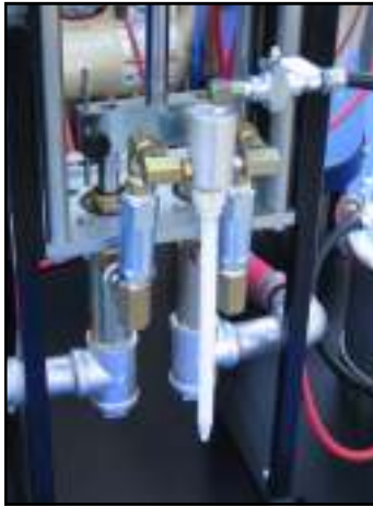
Low cost disposable static mixers have no moving parts and thoroughly mix the epoxy