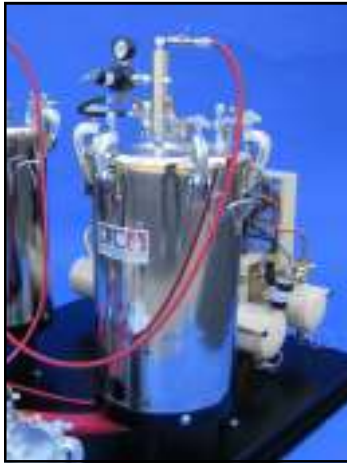
10 gallon ASME rated stainless steel tanks are standard